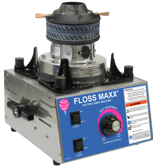
Unit view without Floss Pan